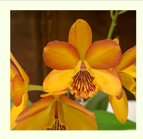
Bullara Blue Ridge Sunset 'Arnie' Exhibited by Arnold Gum Awarded HCC, 76 points